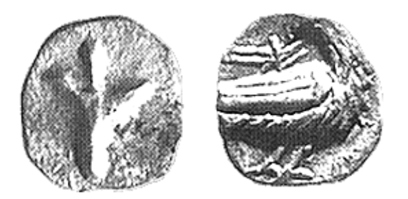
Figure 3: AR: 7mm; 0.30g: |^ (Pl. 1:5-6). Obv.: Flower. Rev.: Bird (dove?) standing r., head turned backwards. Paleo-Hebrew legend above bird.

The flower is a schematic, stylized version of the lily (fleur-de-lis). Another stylized version of a lily occurs on a hemiobol with a falcon on the reverse.<sup>4</sup> The bird (dove?) with head turned backwards on the reverse of our coin occurs regularly on the reverse of the horse head/bird with head turned backwards type.<sup>5</sup> This coin thus establishes a connection (although not a die-link) between the two latter types.