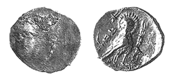
Figure 6: AR; 7/8mm; 0.23g; axis: 12h. Obv.: Human head, facing. Rev.: Owl standing r., facing; the feathers of the head forming a beaded circle. Paleo-Hebrew legend: on r. downward "yehizqiyah" , on l. upward "ha-peha yh(d)" .