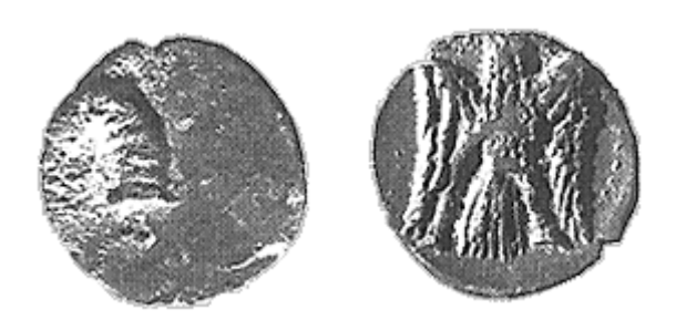
Figure 5: AR; 7mm; 0.30g; axis: 11h. Obv.: Horn. Rev.: Falcon with spread wings, facing; legend (?) off fian.