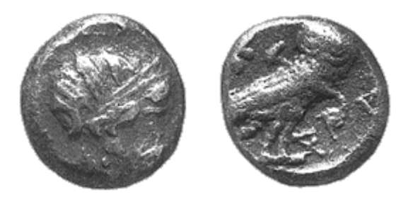
Figure 1: AR; 11 mm.; 2.70g; axis: 1h. Obv.: Head of Athena r., wearing helmet with three olive leaves. Rev.: Owl standing r., facing; behind it on l. olive-spray. Paleo-Hebrew legend, retrograde, from lower l. upwards: "yhd".

The famous Yehud drachm in the British Museum<sup>2</sup> is the only known parallel of a drachm in the repertory of the Yehud coinage. It differs from this coin in depicting on the obverse a male head to right wearing a Corinthian helmet and on the reverse a male divinity to right, seated on a winged wheel. With the exception of two hemidrachms, of the Judean series minted in the early Ptolemaic period, 3 the majority of Judean coins are minute silver fractions. The unique drachm published here weighs 2.70 gr. It shows that the Judean series of the Athena/owl type also included drachms.