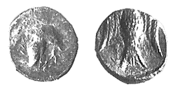
Figure 4: AR; 7mm; 0.30g; axis: 11h. Obv.: Helmet with cheek-piece. Rev.: Falcon with spread wings; head and legend(?) off flan.

The falcon on the reverse of this coin is the same as that of the type with a small bearded male head to right wearing a crown (kidaris) thought to represent the king of Persia.<sup>6</sup> The representation on the obverse of this coin differs in being larger than the bearded head with crown and apparenty depicts a Corinthian helmet.